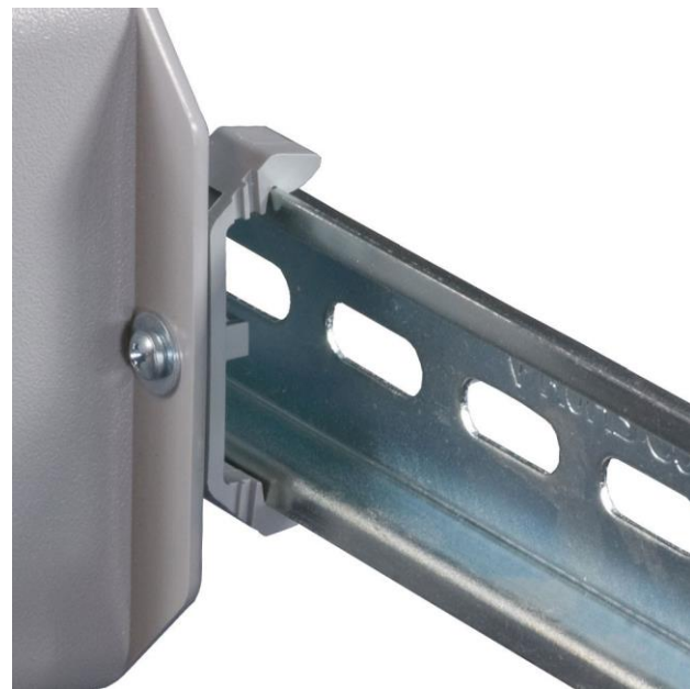
Part: 8114 Model: SeaDAC Lite REL-4